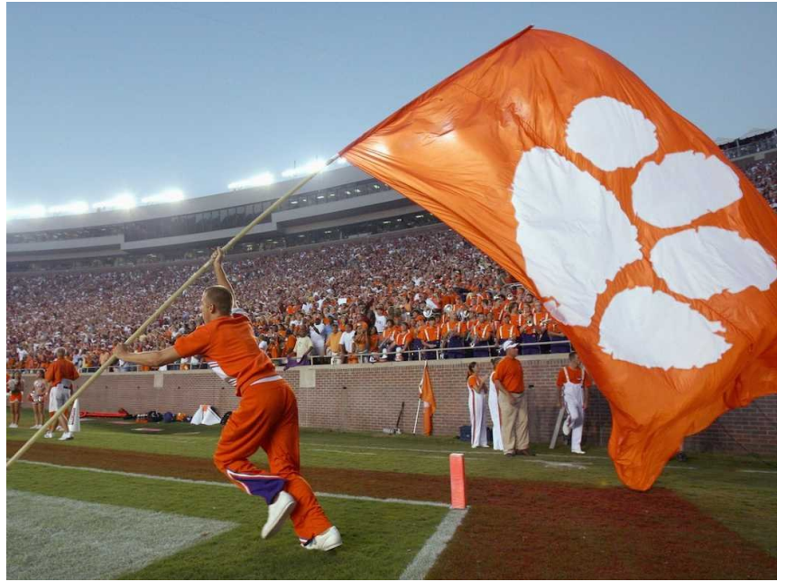
Doug Benc/Getty Images

* Copyright © 2015 Business Insider Inc. All rights reserved.