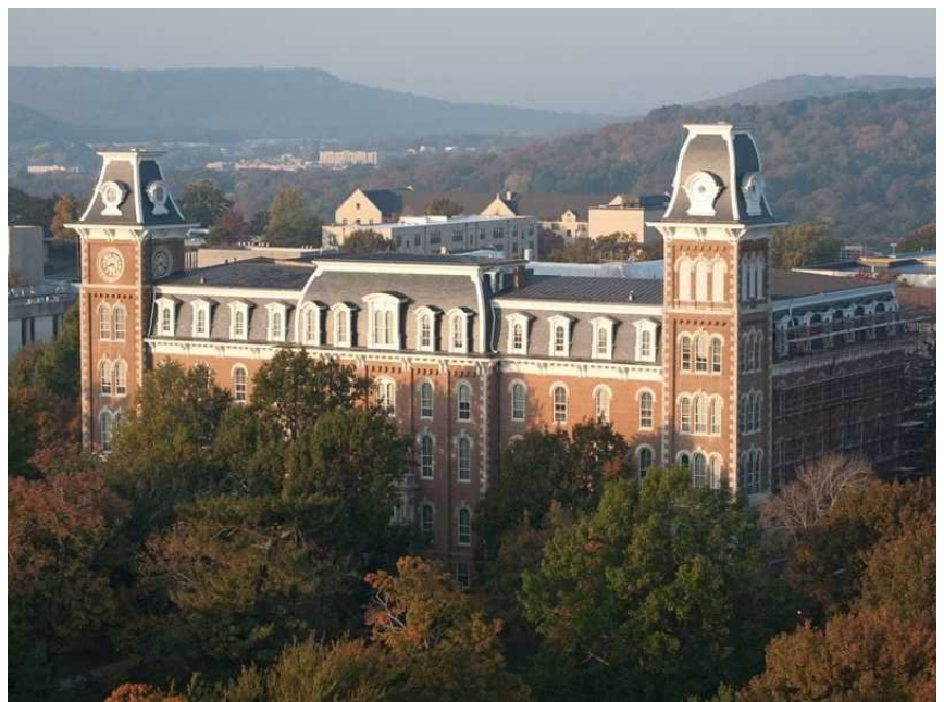
University of Arkansas/Facebook

At the University of Arkansas , located in Fayetteville, students can choose from more than 70 undergraduate degrees in fields spanning from civil engineering to music. The university is also heavily research focused, and it implemented a campaign to become one of the top 50 public research universities in the country. Post-graduation, students earn an average mid-career salary of $83,600.